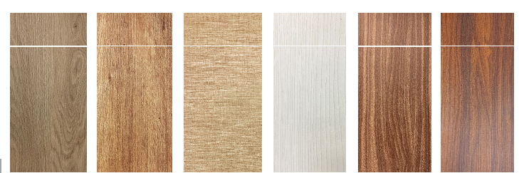
Fresno Bruma Monarca Cairo lino Laricina Nogal Neo Durango