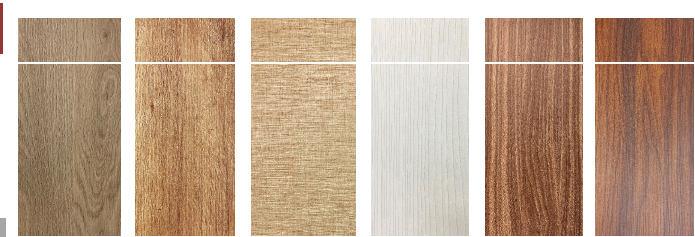
Fresno Bruma Monarca Cairo lino Laricina Nogal Neo Durango